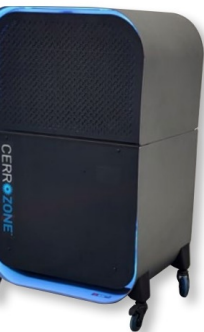
CerroZone Mini (110 CFM) 21" wide x 36" high