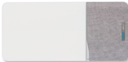
Coming Soon: CerroZone In-Ceiling (110 CFM) 48" x 24"