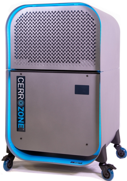
CerroZone Mobile (220 CFM) 28.75" wide x 54" high