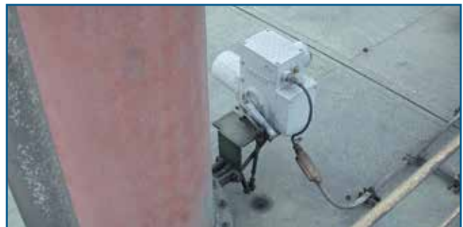
Kiln Reverse Air Fan Damper

Contact a Beck Sales Engineer at 215-968-4600 to find out more about the best actuators for your installations. Visit our website at www.haroldbeck.com . E-mail: sales@haroldbeck.com