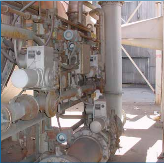
Pre-melt Furnace Gas & Air Valves

Beck actuators provide tight, responsive position control under the most demanding modulating conditions. This precise control makes Beck actuators a key element for improved process efficiency, reduced energy costs and reduced emissions.