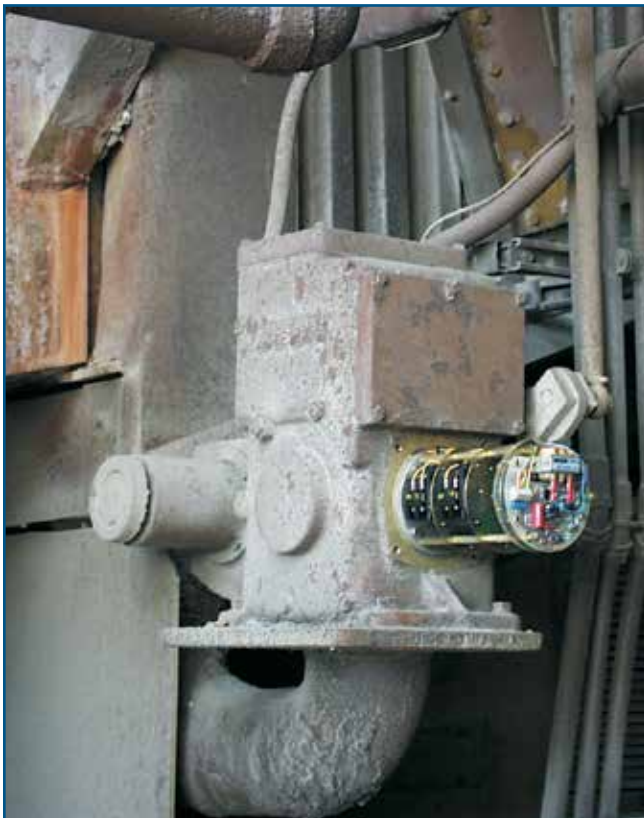
Group 11 actuator with the gasketed control end cover removed