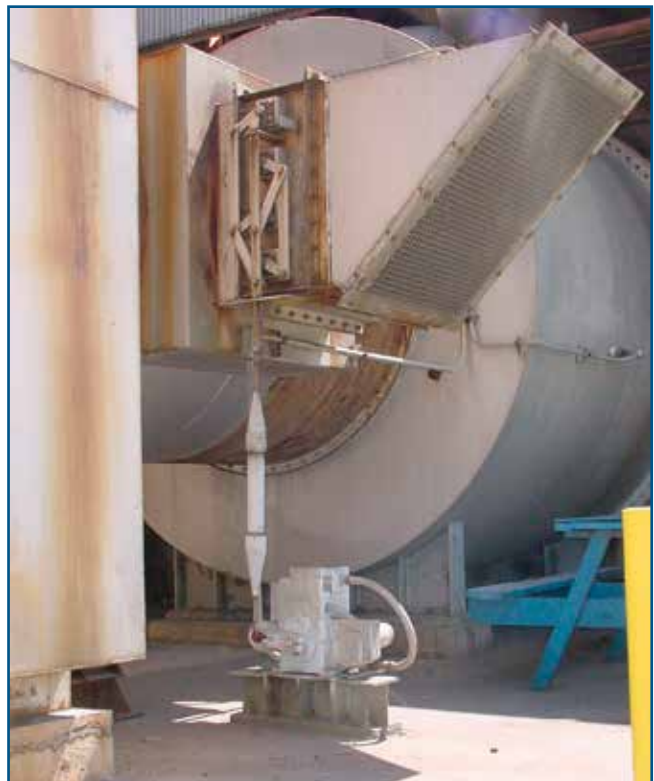
Mixing Air Bottom Damper

Beck's Link-Assist™ program provides a printout showing the optimum actuator and linkage configuration for the application. The linkage arrangement can be characterized to match the torque profile of the application. Request this free service to save time, simplify installation and ensure the best performance at the lowest possible cost.