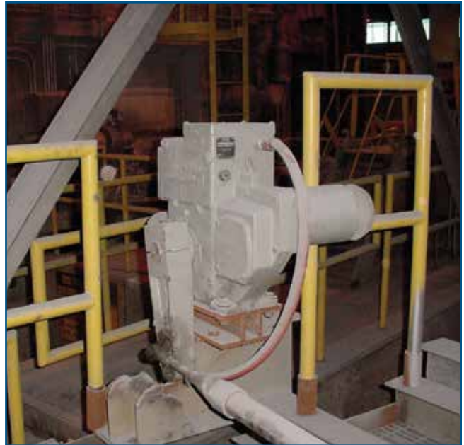
Furnace Combustion Air Damper