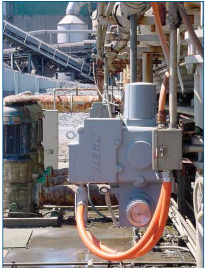
Water Control Valve

On the cover: Alcan's Alma Works Smelter, Quebec, Canada