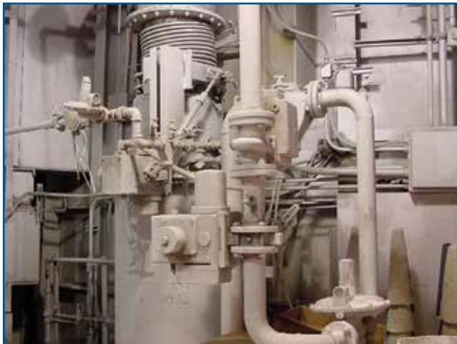
Melting Furnace Gas Valve