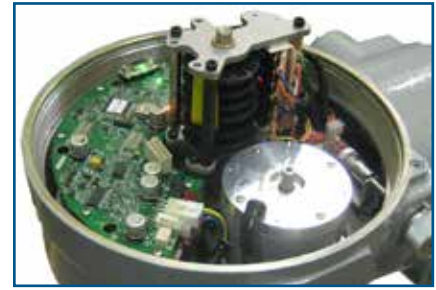
Under the cover of the Group 57 Actuator

ISO 5211 compatible hardware or custom hardware